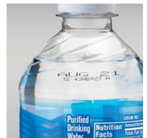
food and beverages